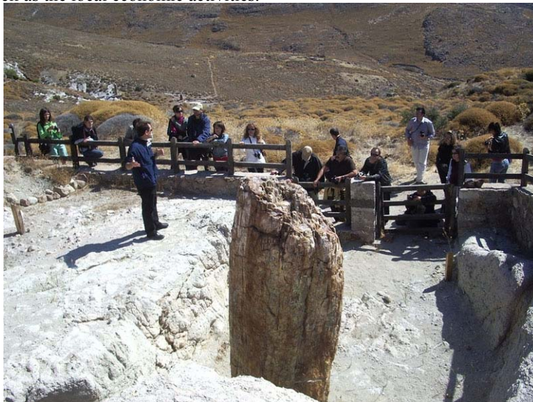
Fig. 2: Guided tour at the Lesvos Petrified Forest Geopark. More than 90.000 visitors every year visit the Museum and the open air parks.

A strategic plan for the sustainable development of the area has been carried out by the Lesvos Geopark in order to link the protection and promotion of geosites with the development of geotourism. This plan takes into consideration the results of the research and excavations in the Petrified Forest area, the presence of important geosites (i.e. volcanic structures, domes, craters, and thermal springs) and biological reserves, the existence of spot interventions and infrastructures as well as the local economic activities.