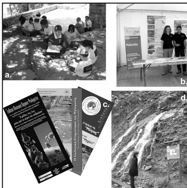
Fig. 4: Some of the activities of Psiloritis geopark. a) Educational field trips on biodiversity, b) Participation in the First International Geopark's fair in Germany, c.) Various publications and promotional material, and d) Information panels.

Very often foreign Universities visit the area to study the bio- and geodiversity of Psiloritis implementing in collaboration with the geopark field trips, mapping courses and sampling. Also, Psiloritis is an important area for local Universities and schools and many scientific articles have been published on several geological, geographical and biological disciplines. An ongoing demand for information on the sustainable development and eco-touristic activities in the broad Psiloritis area is observed recently. Only last year one University and one college classes were introduced and guided to the geotouristic activities of the park and two more summer schools on sustainable development and agrotourism were also hosted in the territory.